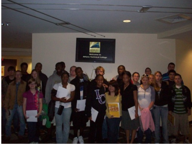
AHS/EHS CTI trip to Athens Tech October 7, 2009