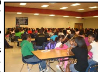
Over 300 students attended the first campus life meeting.