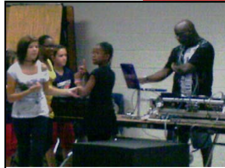
Veterans' cheerleaders sponsored a fundraiser dance on August 19. Above, the DJ is taking requests as students wait in line.